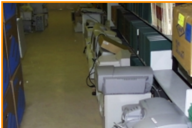
Possible collision/impact hazard, means of escape obstruction