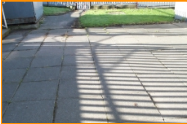
Possible slip/trip hazard – uneven paving stones